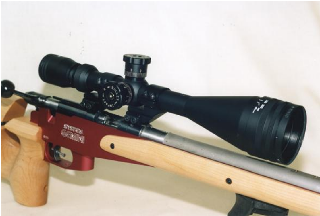
A typical receiver-mounted scope

Telescopic sights of the type normally used by smallbore target rifle shooters are more akin to the sort of sights used by the 'bench rest' riflemen, rather than the rabbit or deer shooters. That means they can be very powerful because smallbore shooters hold their rifles so steadily (!), whereas a vermin or game shooter is unlikely to use anything more powerful than 10x magnification, and a 'bench rest' shooter may go up to 36x or possibly even more.