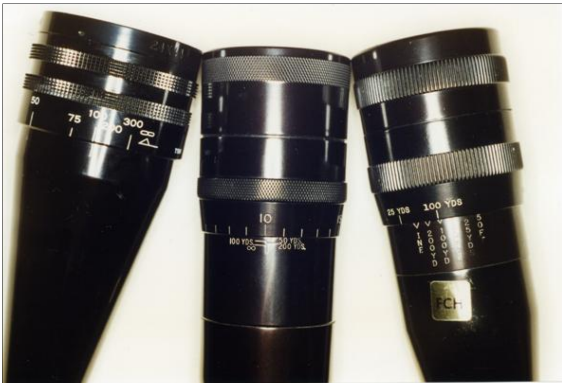
A variety of parallax adjustments

With adjustment in the object lens, the image can be moved the small amount necessary to bring everything precisely into focus.