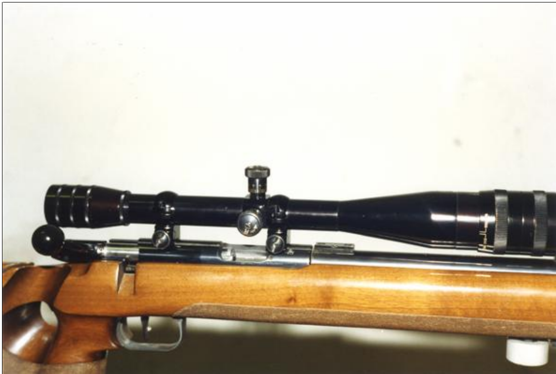
The old Redfield 6400 scope: receiver mounted

If the thought of all that weight bouncing up and down on your barrel bothers you, then Redfield thoughtfully also developed a shorter version, which is designed to be mounted on the rifle's receiver. They called this one the 6400 and it's very similar to its longer brother, as you can see in the photo.