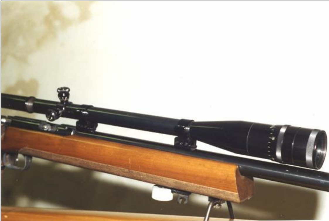
The old Redfield 3200 scope: barrel-mounted

Firstly, one of the most famous of the telescopic sights used around the ranges for .22 rimfire is the Redfield 3200 . Your first impression may be that it's a very long scope and, at 23½ inches, you're not mistaken, but if you're going to mount it half way down your barrel (where the mounting blocks are) then it's going to have to be fairly long.